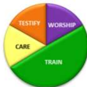
Bible Studies Sunday School