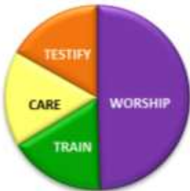
Worship Team Choir