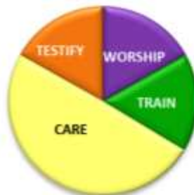
Care Group Recovery