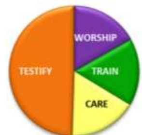
Evangelism Class Alpha